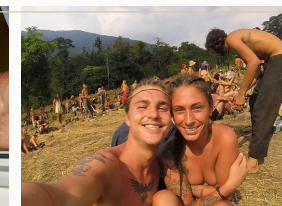
Everyone is welcome in Wales