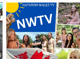
Professional productions & live interactive programs