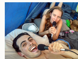
Interactive media & member submissions

Naturism Wales Tv is a new and exciting endeavour that will showcase the naturist lifestyle with soaps, gameshows, documentaries, live entertainment and film. We are so pleased that this fabulous multi channel service is being produced and managed by an award winning film makers a stars of the big screen from south Wales. NWTV is not to be missed.