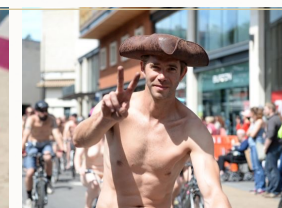
Experiencing naturism & sharing the smiles